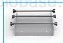
Clamping Rod Shaking Plate