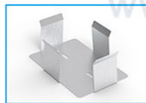
96-well plate Holder